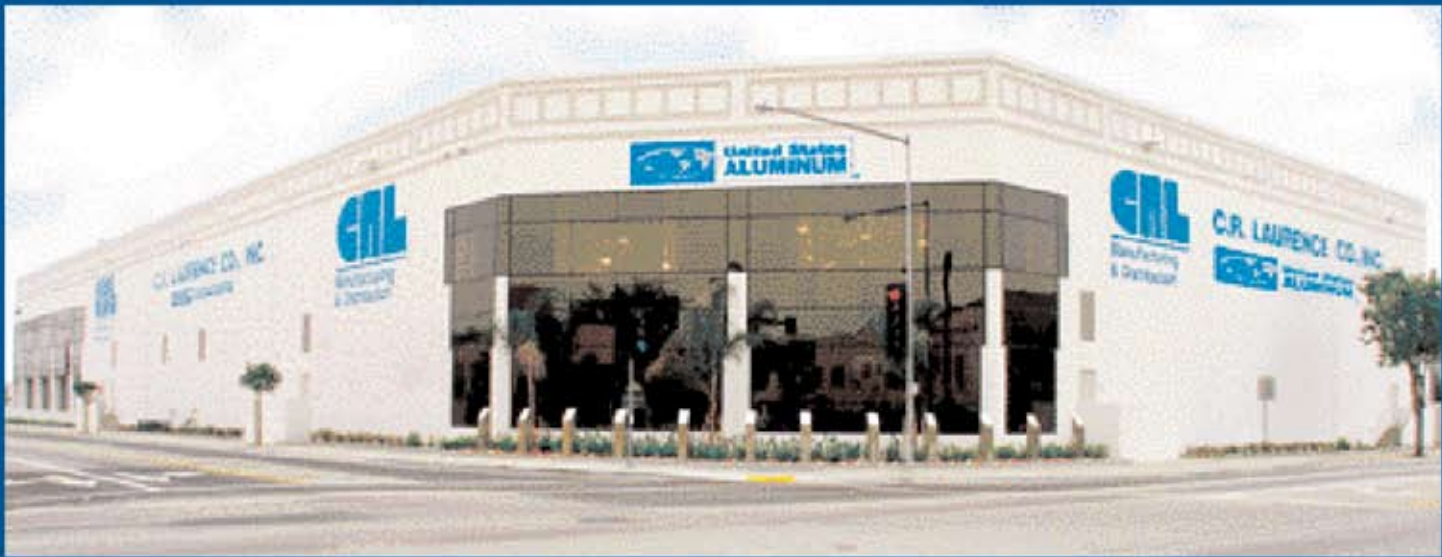
The New U.S. Aluminum Facility in Los Angeles, California