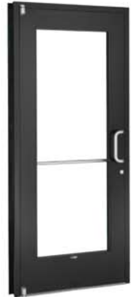
Series 550 Entrance with Clear Hardware and 10" (254 mm) A.D.A. Bottom Rail