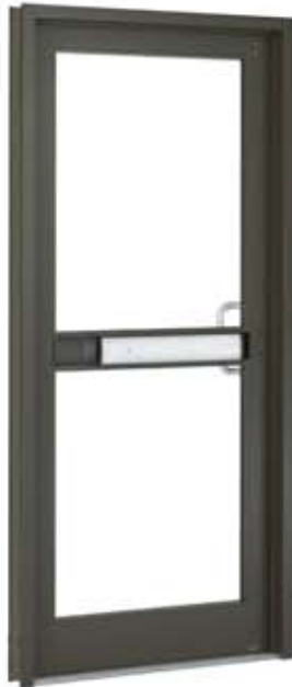
Series 400 Entrance with Mid Panel Exit Device