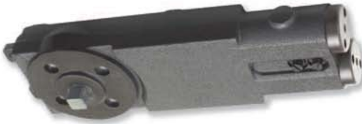
Arm for Center Hung Doors