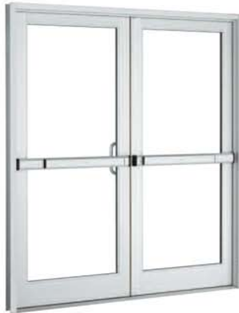
Series 400 Entrance with Standard Exit Device