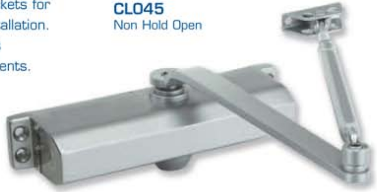
CLO45 Non Hold Open

Surface Mounted Closers are available with brackets for either regular arm, top jamb or parallel arm installation. Adjustable closing and latching speed, as well as adjustable tension to meet barrier-free requirements. Available in clear, bronze or black paint.