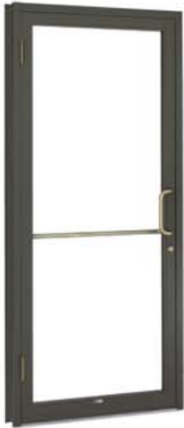
Series 250 Entrance with Champagne Finish Hardware

As an industry leader in the manufacture of entrance doors and frames, United States Aluminum products are consistently built to the highest industry standards, ensuring years of reliable service. Mechanically fastened shear blocks and welded corner construction creates a rugged structural corner assembly backed by a lifetime warranty. These entrances can easily accommodate a wide variety of custom hardware for specific job requirements.