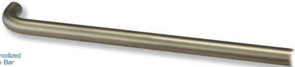
Champagne Anodized Standard Push Bar