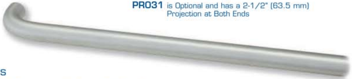
Clear Anodized Standard Push Bar

PR031 is Optional and has a 2-1/2" (63.5 mm) Projection at Both Ends