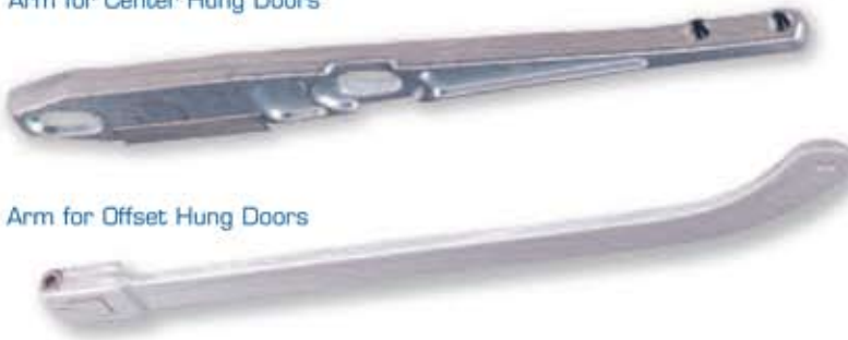
Arm for Offset Hung Doors